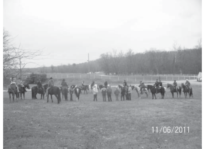
Cowboy Church on Sunday